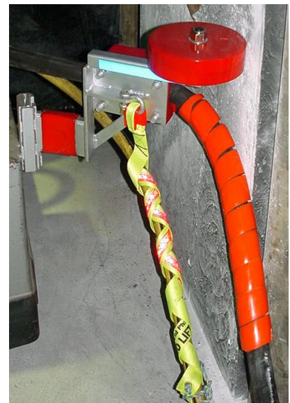
Short Series w Rollers P/N 0111