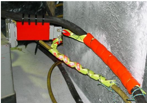
Flexi Arm P/No 0046