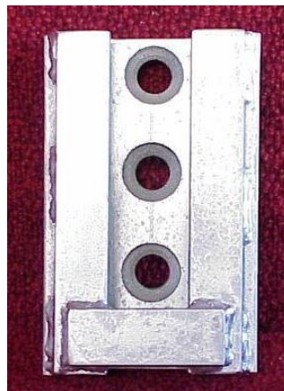
Quick Attach Bracket