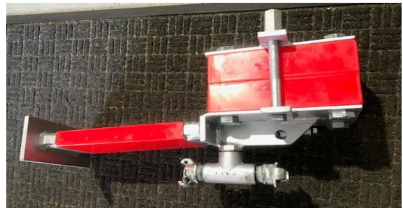
Single Quick Release P/No 0020 1"BSPTQR