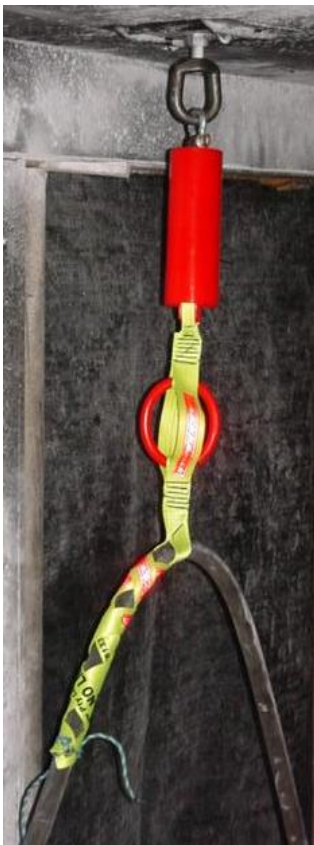
P/No 0052 DSAS